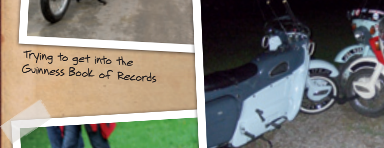
Nice to see these at an overseas rally