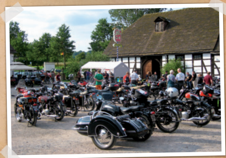
Like night follows day, the party ends up at the beer garden...