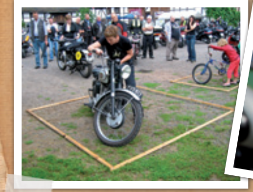
The children joined in the Silly Games too