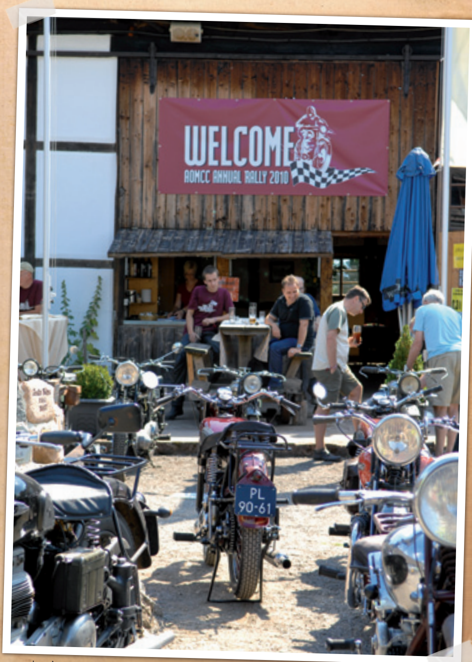
... and welcome is how we were made to feel