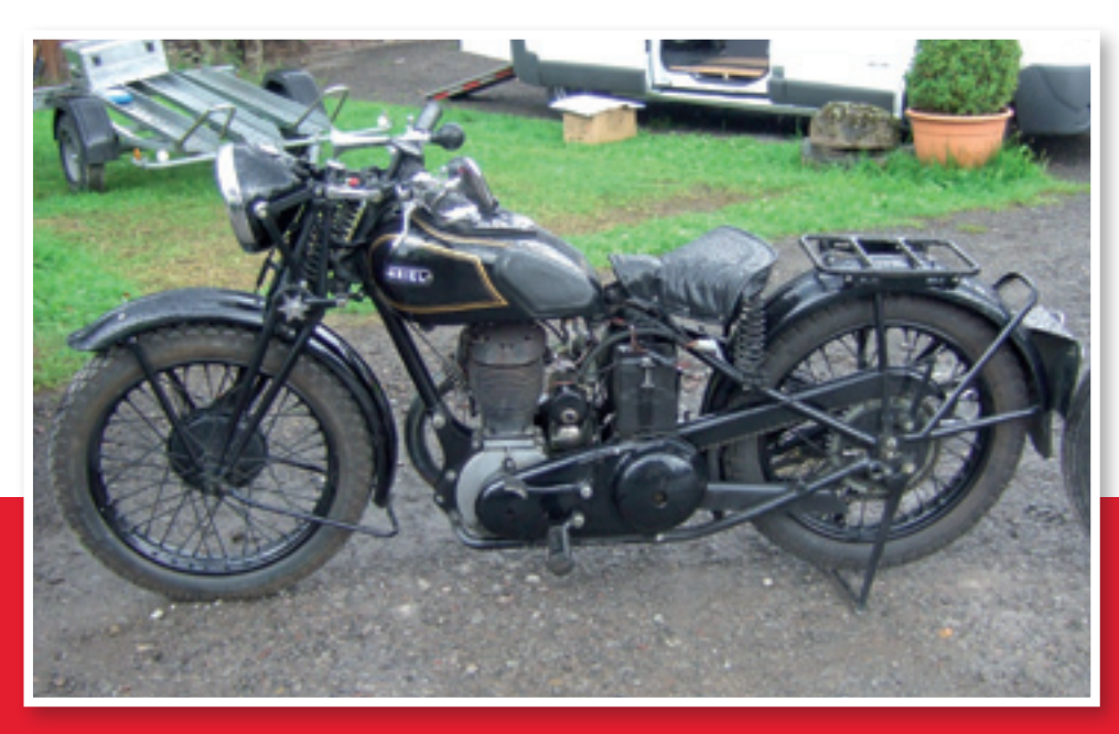
The author's extremely rare and original 1934 VA. We so seldom see one of these – Ed.