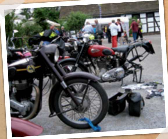
So that's where the wheel came from