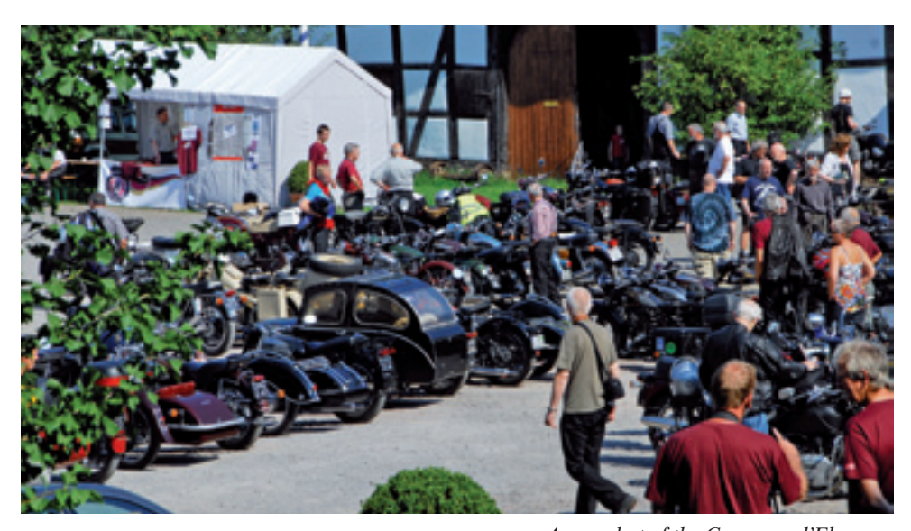
A snapshot of the Concours d'Elegance

The results I found interesting, though – the quality of the machines was superb and well deserved the awards, even though some came on a trailers. Are attitudes changing towards bikes on trailers, I ask?