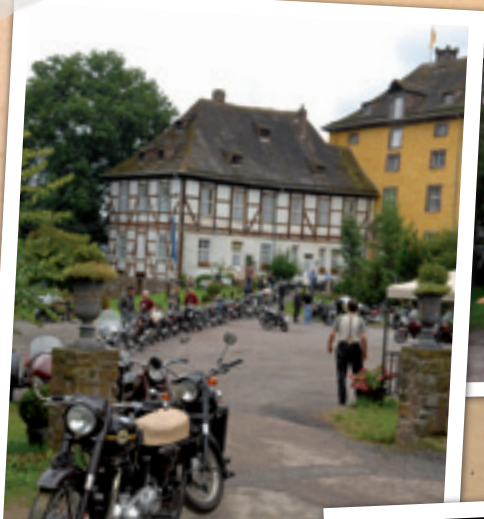
Book in here...