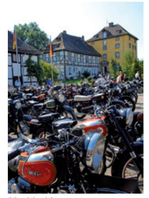
Bikes, bikes, bikes...

but instead chilled out in the sun and checked the bikes ready for our onward journey. That's when my problem really started.